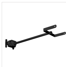
14453480 1000 mm arm completes with connection base GUELL ZERO