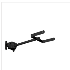
14453380 500 mm arm completes with connection base GUELL ZERO